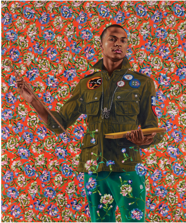
Anthony of Padua , 2013, Kehinde Wiley, American, born 1977, oil on canvas.