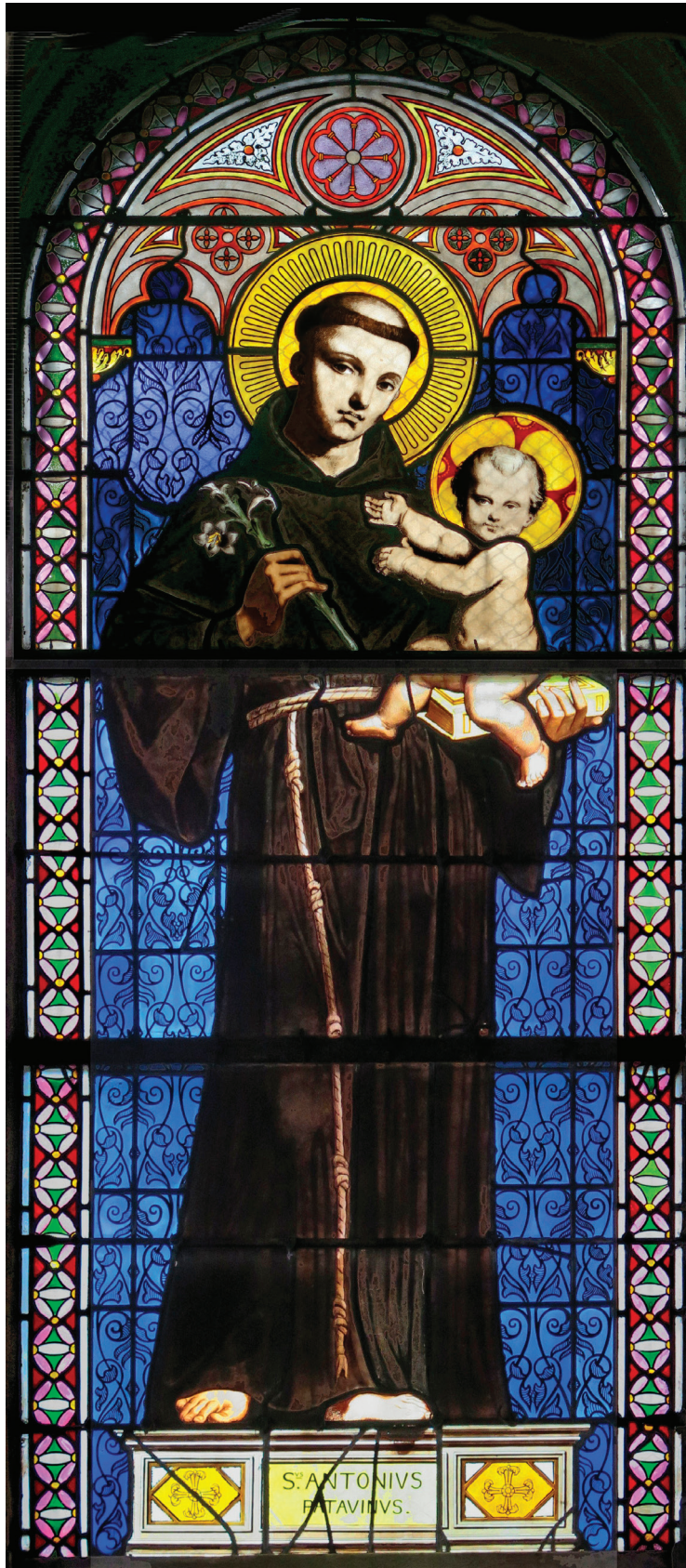
Saint Anthony of Padua , ca. 1843–1844, Jean-Auguste-Dominique Ingres, French, 1780–1867, stained glass window fabricated from the artist's design, 86 5/8 x 36 3/8 in. Chapelle St.-Ferdinand, Porte des Ternes, Paris.