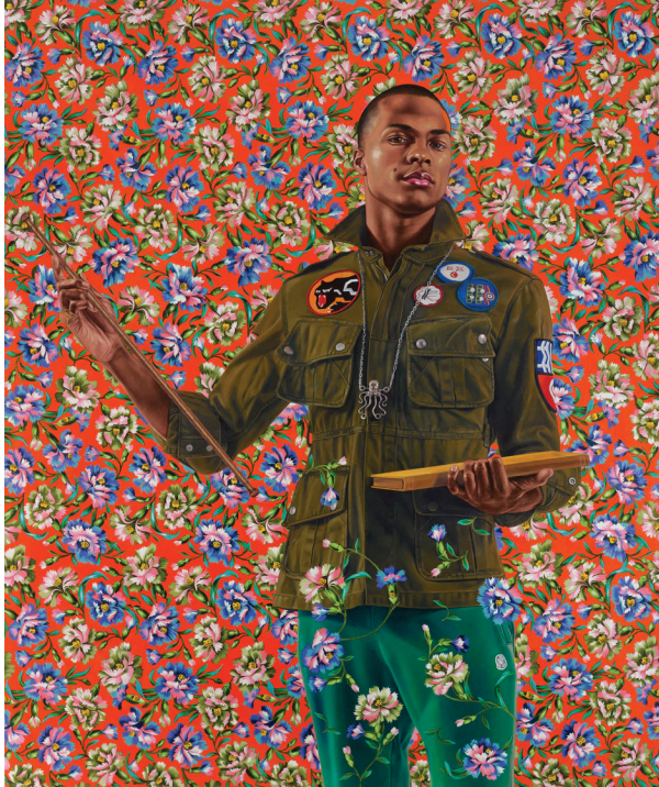
Anthony of Padua , 2013, Kehinde Wiley, American, born 1977, oil on canvas.

Kehinde Wiley’s Anthony of Padua , part of SAM’s permanent collection, borrows the pose from a nineteenth-century French stained glass window of Saint Anthony of Padua . While the original includes props designed to indicate the saint’s piety, purity, and scholarship, Wiley’s recreation tells the story of a powerful young African American man. From his military style jacket with its black panther patch (a symbol of the 66th Infantry Division of the US Army during World War II later adopted by the Black Panther Party ) to his large silver octopus necklace, the model portrays a sense of individualism and authority. Yet the portrait plays on historical themes, with the book and staff often found in classical European portraits, along with the elaborate floral background. In the background creeping into the foreground, viewers see another of Wiley’s hallmarks—his detailed floral patterns. Adapted from historical wallpapers and patterns, or in the case of his World Stage series from cultural references, these designs add a richness of texture and depth to these luxurious portraits. Like any good hip hop artist, Wiley samples from these well known themes, mashing them up with his own take on what power can look like in our contemporary world to create a compelling work that tells its own unique story.