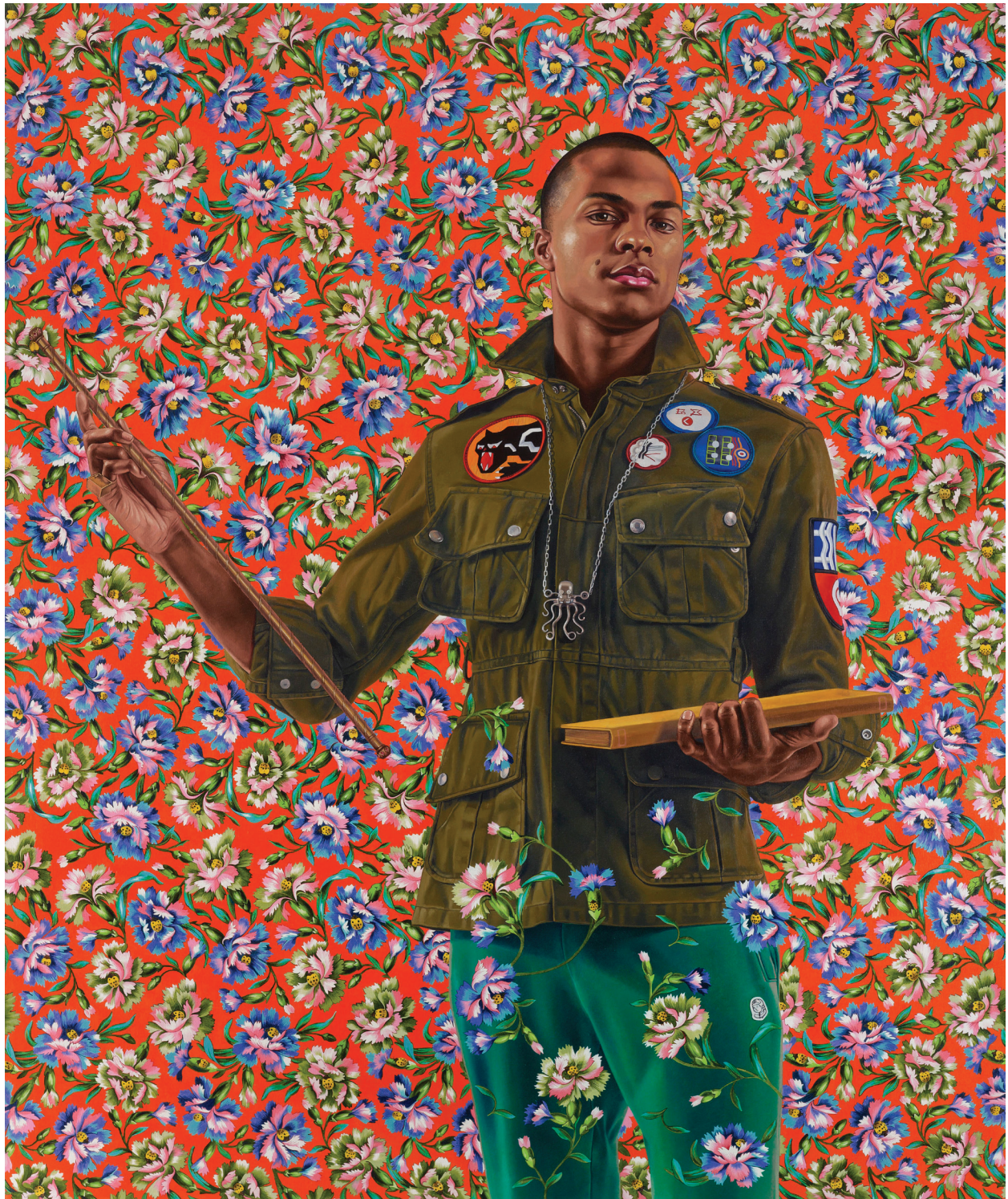
Anthony of Padua , 2013, Kehinde Wiley, American, born 1977, oil on canvas, 72 × 60 in., Seattle Art Museum, Gift of the Contemporary Collectors Forum, 2013.8. © Kehinde Wiley.