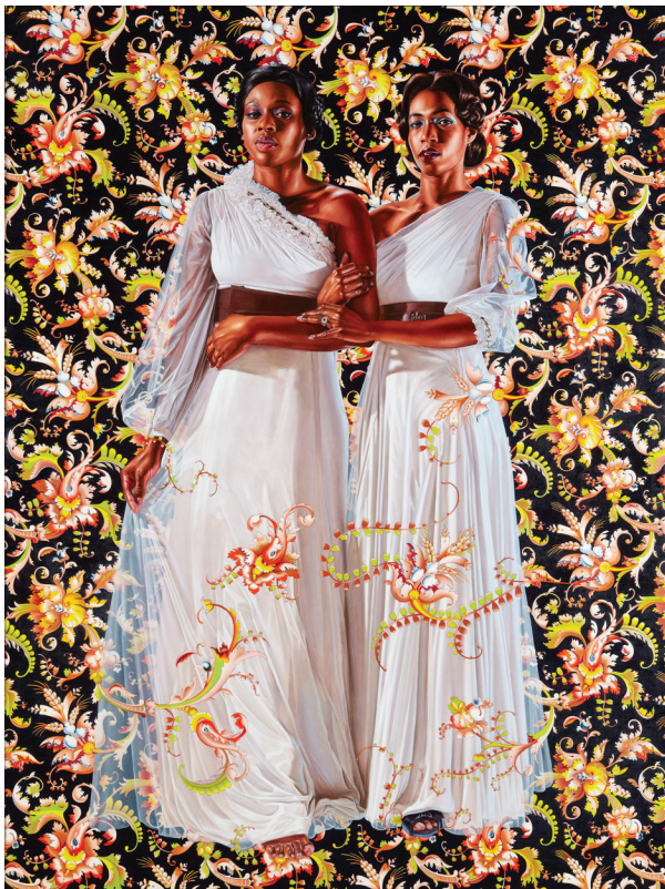
The Two Sisters , 2012, Kehinde Wiley, American, born 1977, oil on linen.

The Two Sisters gives the sitters a tender and self-assured appearance. The women stand with linked arms looking directly at the viewer. Throughout the work, he plays with light, highlighting the sheen of their ornate hairstyles, the deep luster of their skin, and the translucency of their flowing gowns. He continues to amplify the feminine aspects with the elaborate floral background which seems to spring to life in places like a growing plant, overlapping part of their dresses.