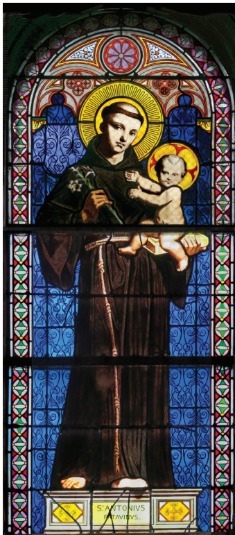
Saint Anthony of Padua , ca. 1843–1844, Jean-Auguste-Dominique Ingres, French, 1780–1867, stained glass window fabricated from the artist's design.