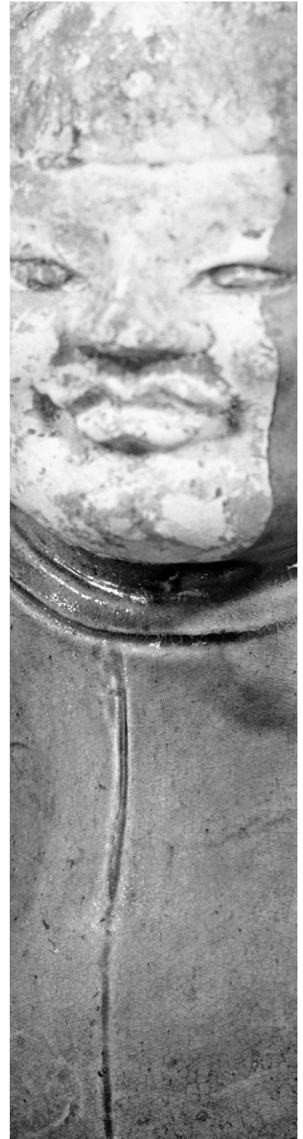
Dwarf Chinese Tang period, 618-907, early 7th-early 10th century Ceramic 8 5/16 x 4 3/16 x 3 1/4 in. (21.12 x 10.64 x 8.26 cm) Seattle Art Museum, Eugene Fuller Memorial Collection, 48.247

General Information 206.654.3100 TDD 206.344.5267 McCaw Library 206.654.3202 SAM SHOP 206.654.3160 Box Office 206.654.3121 Wyckoff Teacher Resource Center 206.654.3186