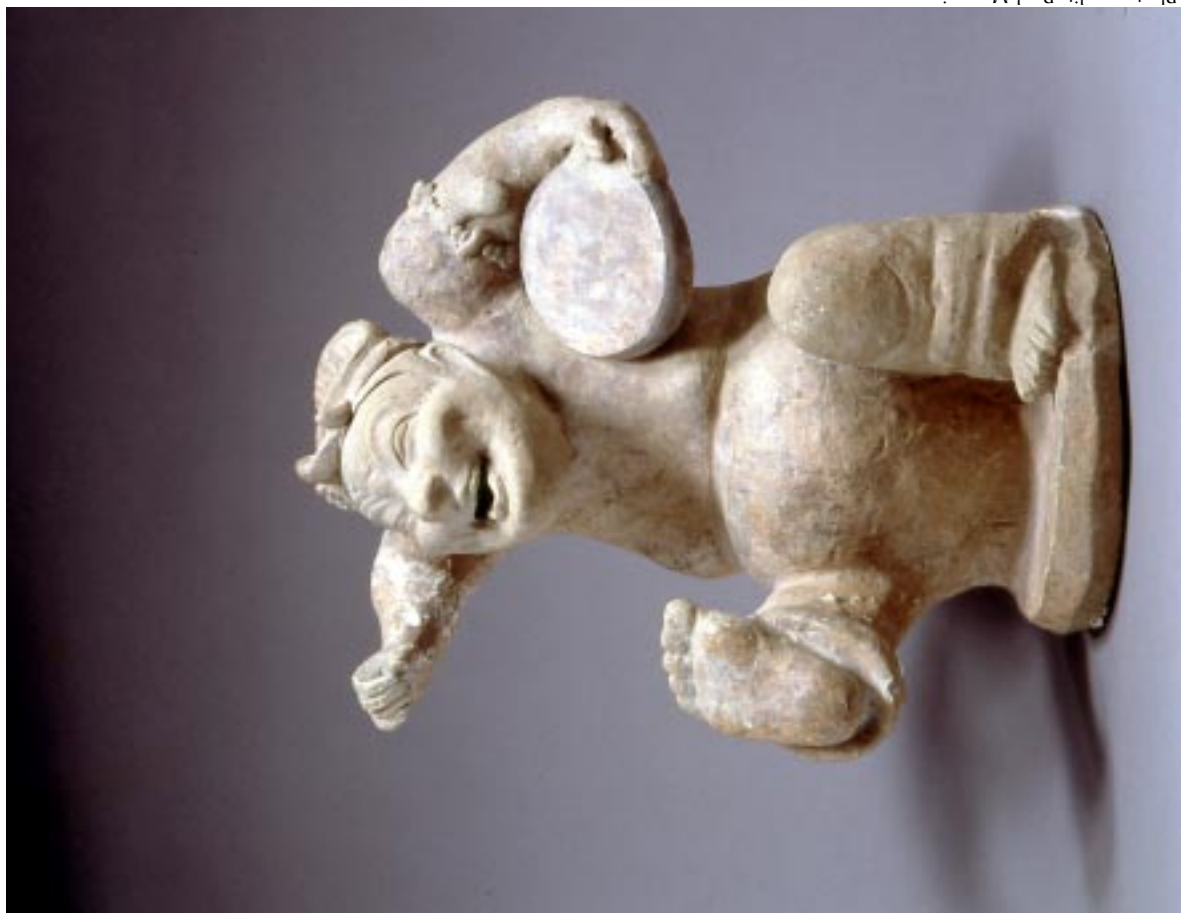
Figure of a squatting drummer , Ceramic, Height 48 cm, First or second century AD (Eastern Han), Excavated in 1982 from Xindu Sanhexiang, Majiashan, Xindu County Bureau of Cultural Relics