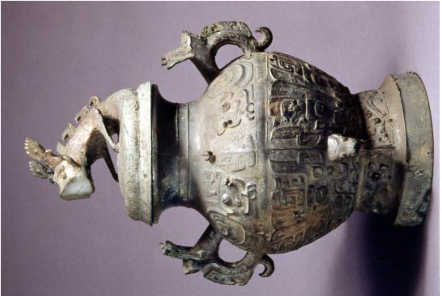
Lei , Bronze, Height 50 cm, diameter of mouth 17.4 cm, Late eleventh or early tenth century BC. Excavated in 1959 at Pengzhou Zhuwajie, Sichuan Provincial Museum 83438