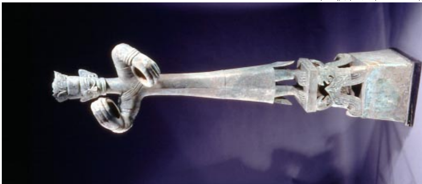
Figure on pedestal , Bronze, Overall height 260.8 cm; height of the figure 172cm; weight 180 kg, Twelfth century BC, Excavated from Sanxingdui Pit No. 2 [K2(2):149, 150], Sanxingdui Museum 00643