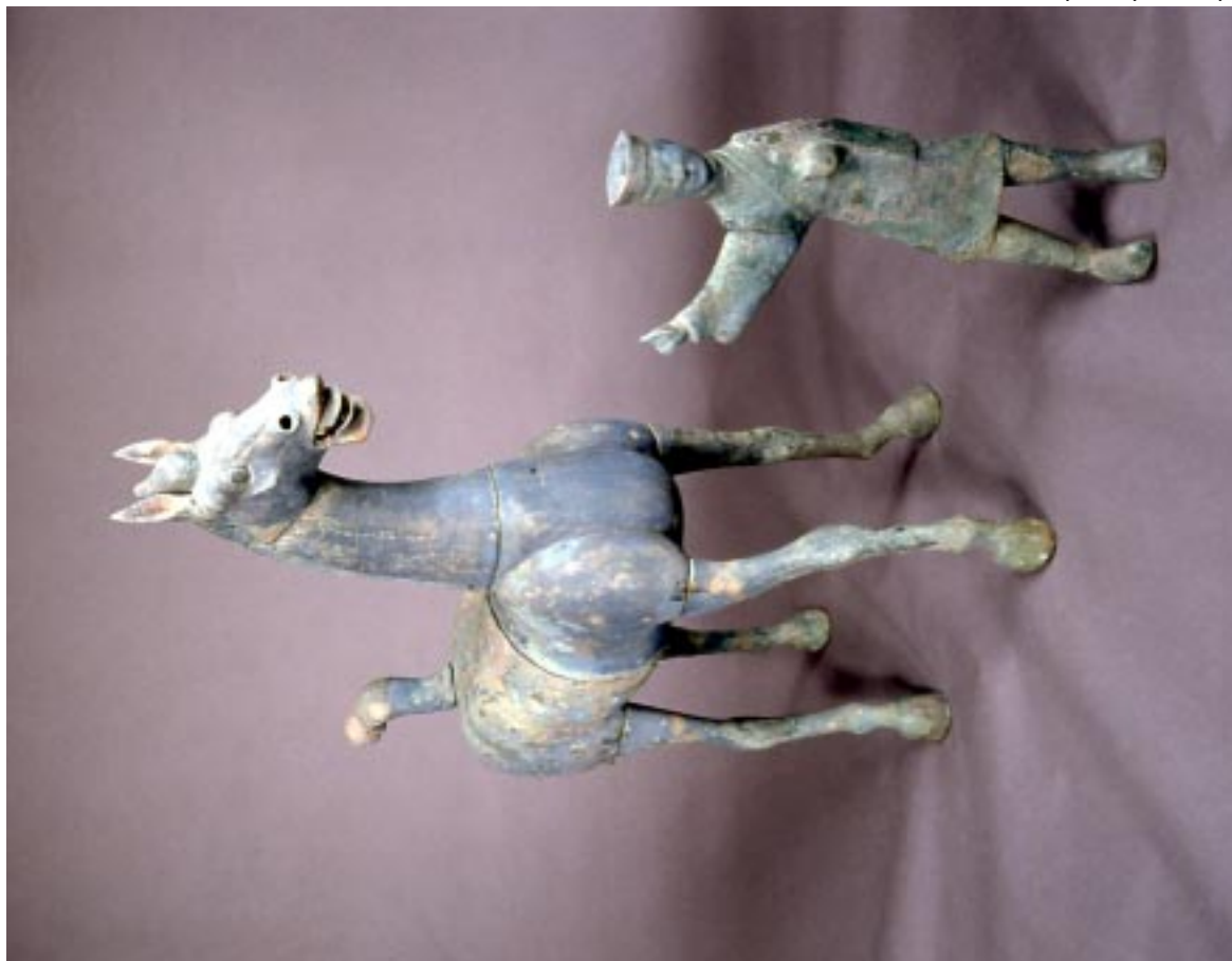
Horse and groom , Bronze, Height of the horse 135 cm, height of the groom 67 cm, First or second century AD (Eastern Han), Excavated in 1990 from Mianyang Hejlashan tomb 2, Mianyang Museum