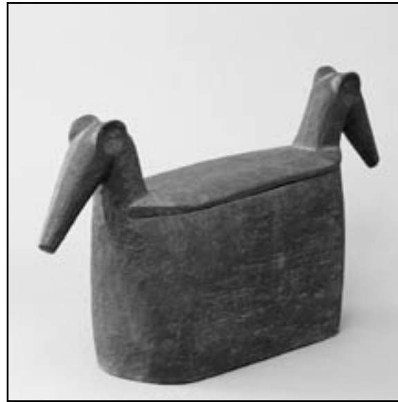
Tobacco container (koppit) Early 20th century Wood 5 x 5 x 4 in. 2003.97