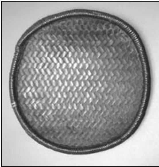
Bowl (duya) 19th century Tindalo wood 2 x 10 in. 2003.87