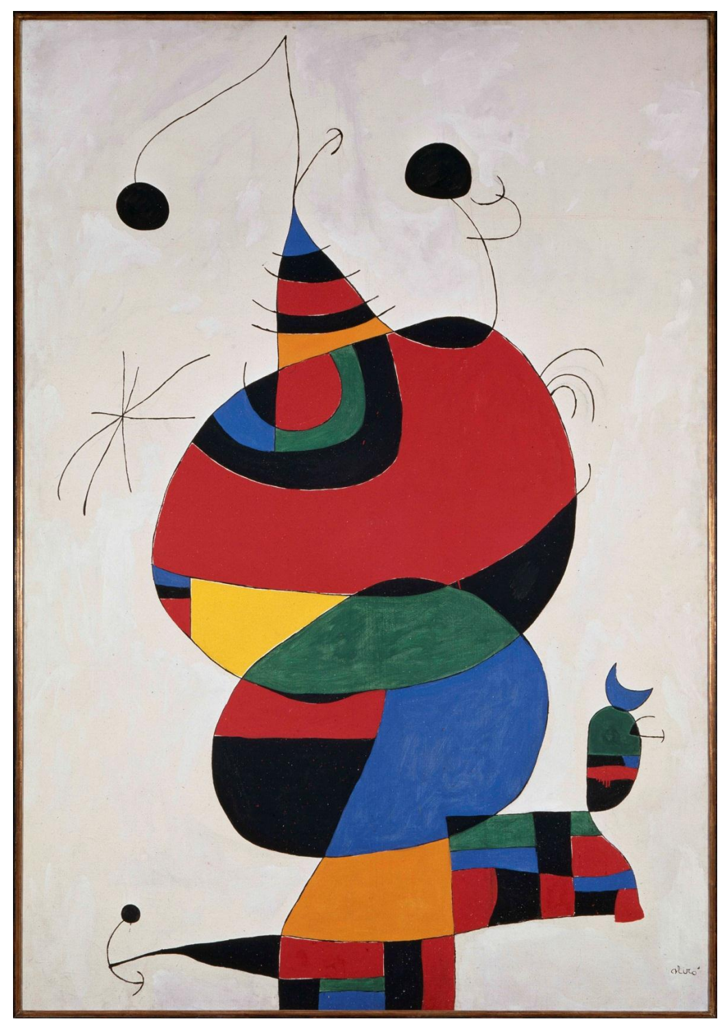
UNIT FOUR: SHAPE AND SYMBOLISM: FOCUS ON CRITICAL THINKING Image from \it Mir\'o : The Experience of Seeing

Woman, Bird and Star (Homage to Picasso), February 15, 1966 / April 3-8, 1973, Joan Miró, Spanish, 1893-1983, oil on canvas, 96 7/16 x 66 15/16 in., Museo Nacional Centro de Arte Reina Sofía. © Successió Miró / Artists Rights Society (ARS), New York / ADAGP, Paris 2014.