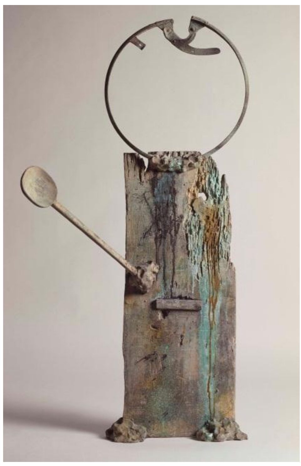
UNIT TWO: TEXTURE AND MEANING: FOCUS ON COMMUNICATION Image from Miró: The Experience of Seeing

The Warrior King, 1981, Joan Miró, Spanish, 1893-1983, lost-wax casting, patinated bronze, 485/8 \times 243/16 \times 159/16 in., Nacional Centro de Arte Reina Sofía, © Successió Miró /Artists Rights Society (ARS), New York /ADAGP, Paris 2014.