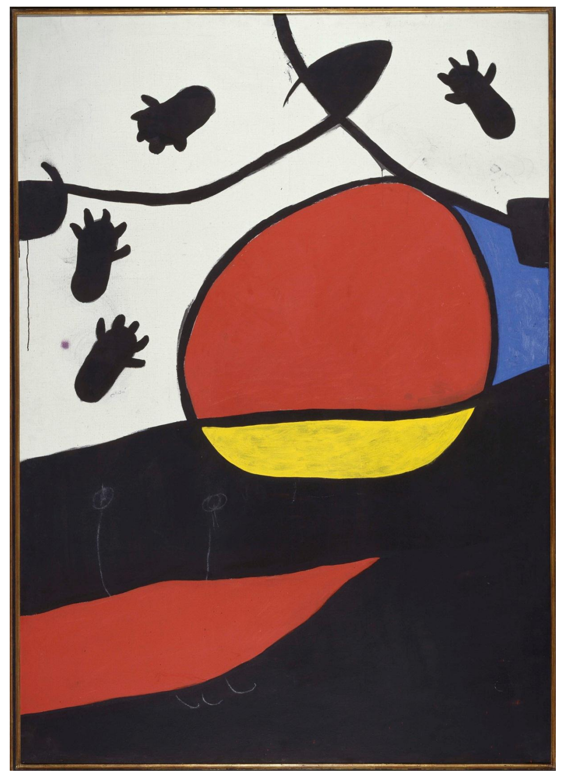
UNIT THREE: LINE AND LANDSCAPE: FOCUS ON CREATIVITY Image from Miró: The Experience of Seeing

Landscape, 1974, Joan Miró, Spanish, 1893-1983, acrylic and chalk on canvas, 96 1/16 x 67 1/2 in., Museo Nacional Centro de Arte Reina Sofía, © Successió Miró /Artists Rights Society (ARS), New York /ADAGP, Paris 2014.