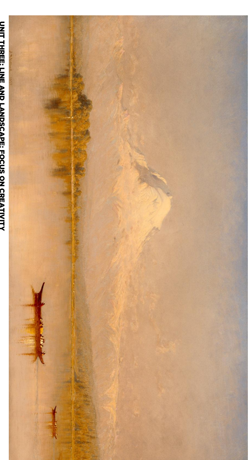
UNIT THREE: LINE AND LANDSCAPE: FOCUS ON CREATIVITY Image from the Seattle Art Museum's Collection