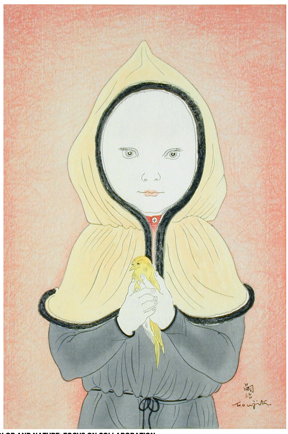
UNIT ONE: COLOR AND NATURE: FOCUS ON COLLABORATION Image from the Seattle Art Museum's Collection

Girl with Bird, Fujita Tsuguji, Japanese, 1886 – 1968, Woodblock (restrike), Seattle Art Museum, Gift of Frances and Thomas Blakemore, 98.53.121, © 2014 Artists Rights Society (ARS), New York / ADAGP, Paris.