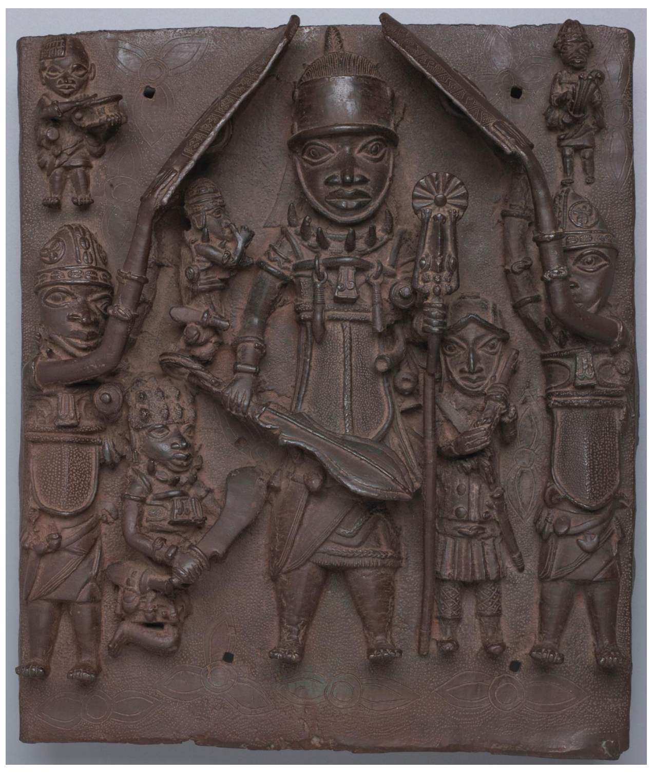
UNIT TWO: TEXTURE AND MEANING: FOCUS ON COMMUNICATION

Plaque: Oba and attendants, ca. 1550–1650, Nigerian, Benin, Cast bronze (cire perdue), 18\ 1/2\ x\ 4 in. (47\ x\ 39.4\ x\ 10.2\ cm) , Seattle Art Museum, Gift of Katherine White and the Boeing Company, 81.17.496.