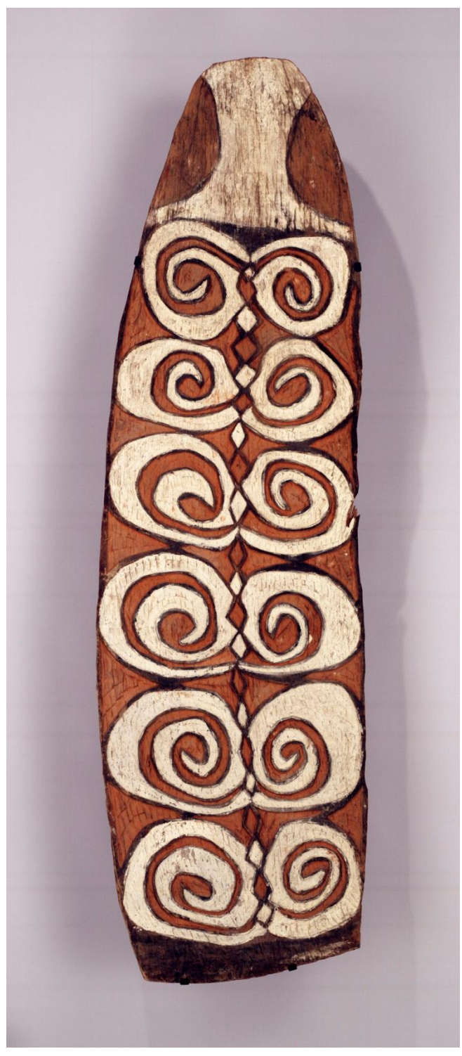
UNIT TWO: TEXTURE AND MEANING: FOCUS ON COMMUNICATION Image from the Seattle Art Museum's Collection