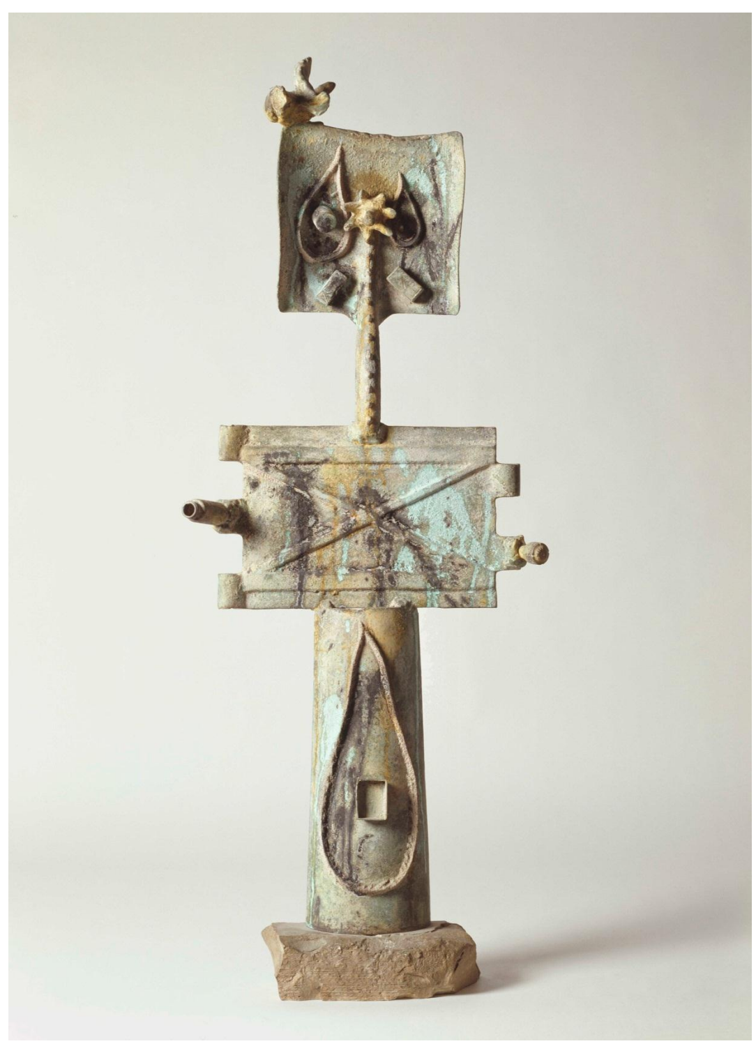
UNIT ONE: COLOR AND NATURE: FOCUS ON COLLABORATION Image from Miró: The Experience of Seeing

Woman and Bird, 1970, Joan Miro, Spanish, 1893-1983, lost-wax casting, patinated bronze, 48 1/16 x 18 7/8 x 5 1/8 in., Museo Nacional Centro de Arte Reina Sofía, © Successió Miró /Artists Rights Society (ARS), New York /ADAGP, Paris 2014.