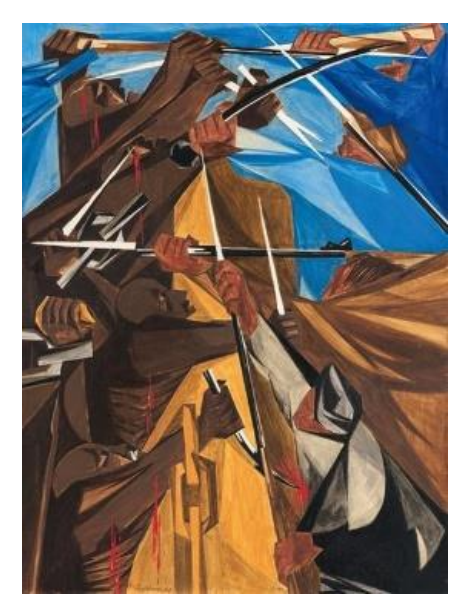
<u>Jacob Lawrence: The American Struggle</u> February 11-May 23, 2021

This exhibition reunites Jacob Lawrence's revolutionary thirty-panel series Struggle . . . from the History of the American People (1954-56) for the first time since 1958. One of the greatest narrative artists of the twentieth century, Lawrence (1917-2000) is best known for The Migration Series (1940-41), exhibited at SAM in 2017, which tells the story of the mass exodus of African Americans from the rural South to the industrial North following World War II. Struggle is also a narrative work in series and engages key moments from the American Revolution and the early decades of the republic to address, as Lawrence put it. "the struggles of a people to create a nation and their attempt to build a democracy."