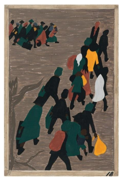
The Migration Series, Panel 18: The migration gained in momentum.

Highlights include a talk by Pulitzer Prize-winning author Isabel Wilkerson and the return of the Complex Exchange series